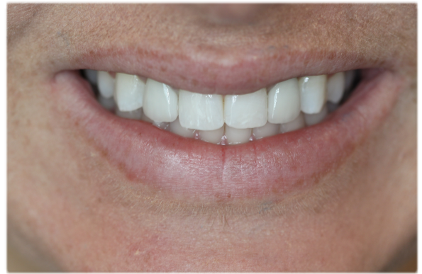
Can you spot the two implanted teeth? (Dentistry done by Hebert Dental)

They also help restore and increase bite power and stop teeth from shifting. So they have a lot of advantages.